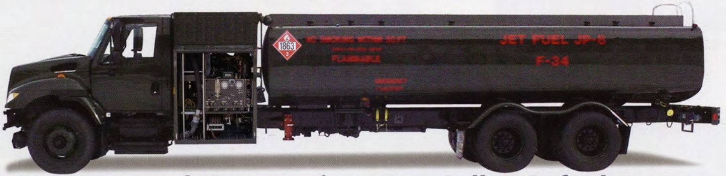
Kovatch Corporation 6000 Gallon Refueler